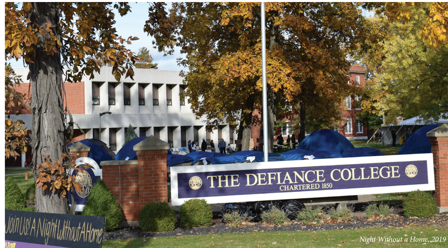
Please note that because this is an inaugural report, we suspect that service at Defiance College was significantly underreported for the 2019-2020 academic year. We anticipate that reporting in 2021 will more accurately reflect the service at Defiance College.