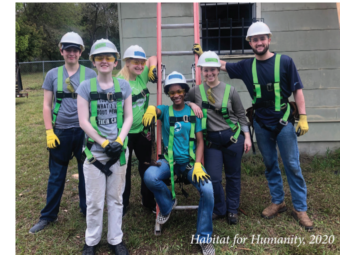
Habitat for Humanity, 2020