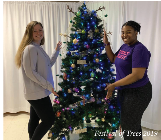
Festival of Trees 2019

During the 2019-2020 academic year, The Service Leadership Program supported its 87 Service Leaders as they spent 650 service hours engaged within the regional community. These hours were in addition to the great work that Service Leaders do in conjunction with other service, service learning, and community-based research programming throughout the College, such as APO, the McMaster School for Advancing Humanity, and coursework embedded opportunities.